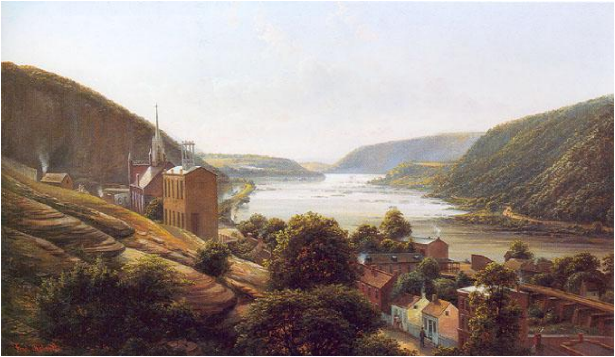
Pos 41 ? "View of Harper's Ferry" (mit skøn – se katalogbeskrivelse) Officielt: (p. 1857) "View of the Potomac Watergap from Jefferson Rock"