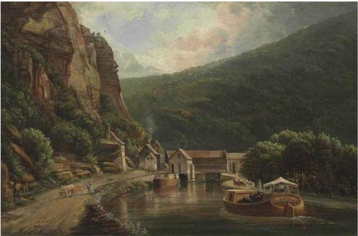
Pos 42 ? "View of The Canal at Harpers Ferry" (mit skøn) Officielt: "Harpers Ferry"